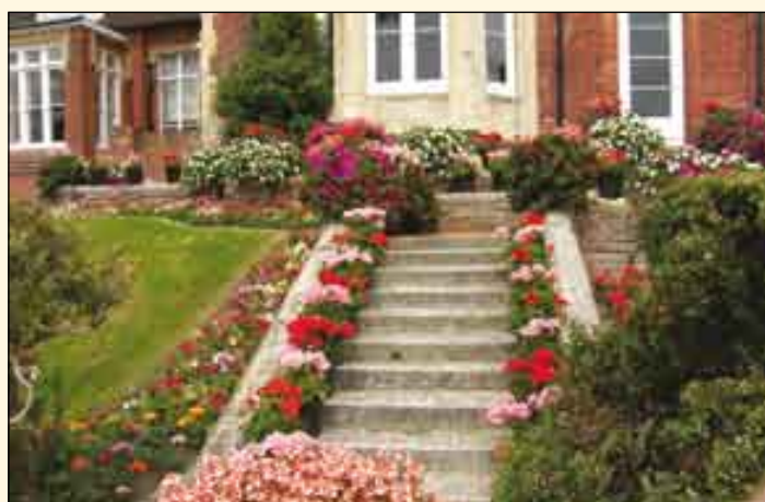
Flowers on the terraces at Vernon Holme