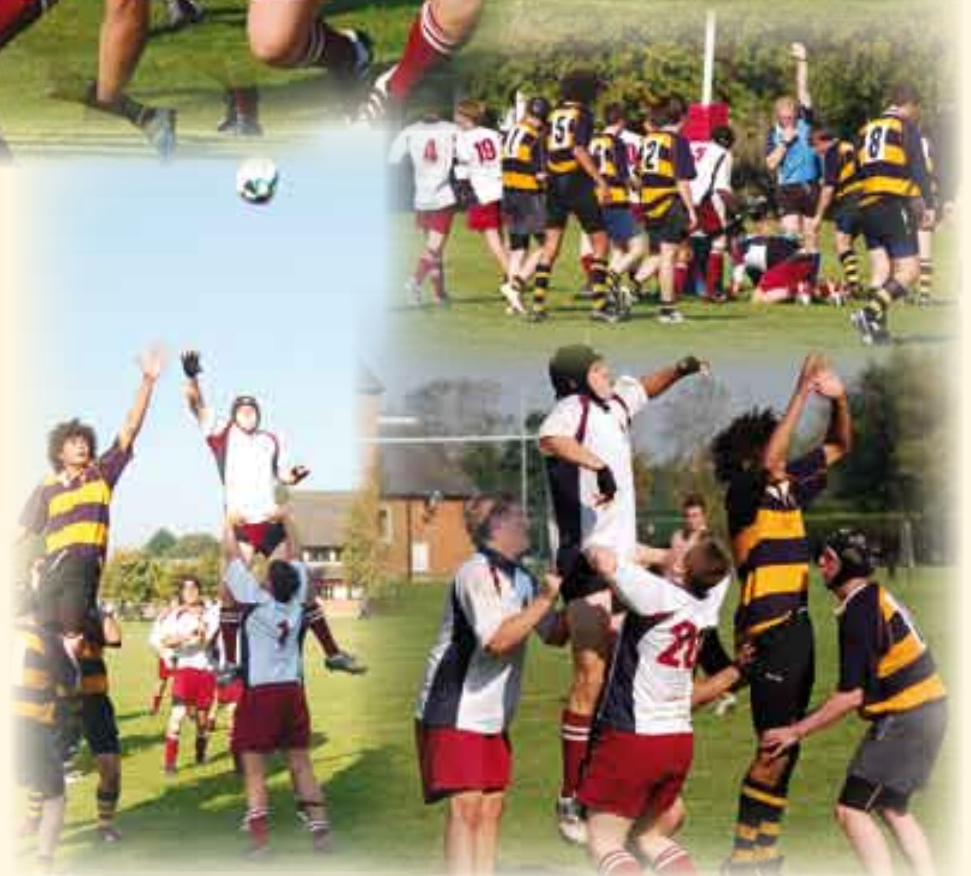
1st XV in action against Maidstone and Simon Langton Grammar Schools