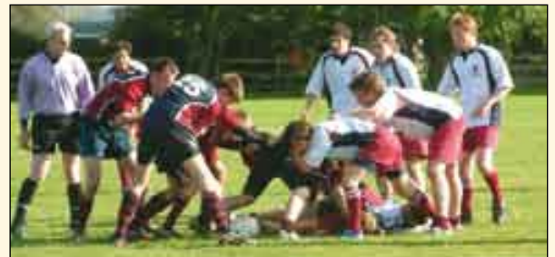
1st XV in action