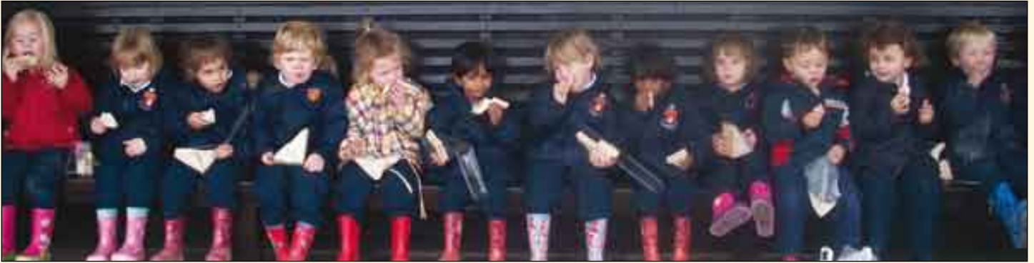
Picnic lunch on Tankerton Seafront

To consolidate our learning, the Nursery took their education into the outside environment by spending four days on the road!