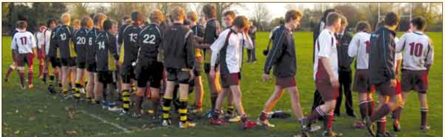
1st XV against Westcliff

I found it a novel experience to referee a match between my old school and KC. It was a hard fought encounter, especially at the breakdown, where both teams retained possession well. Westcliff however proved more clinical in converting their opportunities and ended victorious 34-0.'