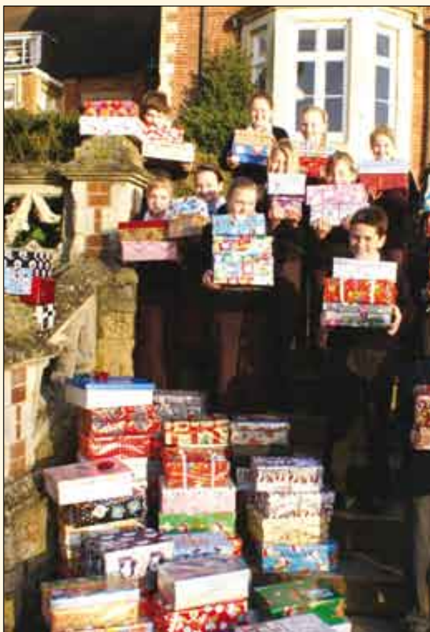
Junior School Christmas Shoeboxes