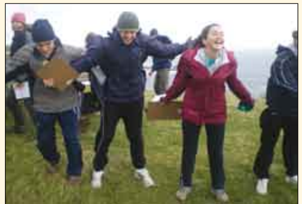
Testing wind speeds

The first day in the field involved Hydrology. We followed the course of the River Harbourne from the source on Dartmoor to the Kingsbridge Estuary. At various sites along the river we stopped to measure aspects of the river from hydrological variables to landuse changes. A detailed study of the flood management scheme at Harbaton provided an excellent example of river management.