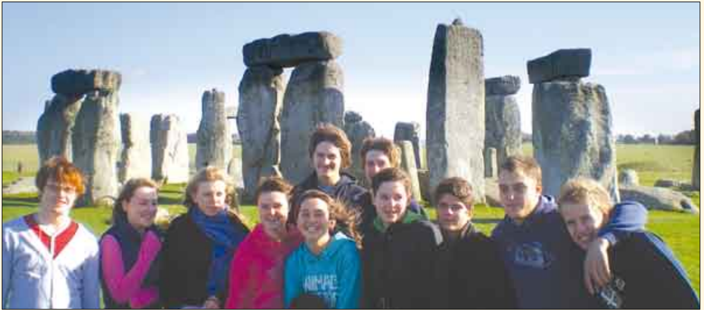
AS geographers get to grips with the past

The Geography department took a group of 6.1 students to Slapton in South Devon for their AS fieldwork. The trip was designed to support the AS modules of teaching, providing detailed case studies and fieldwork skills. We made use of the Field Studies Council centre in Slapton.