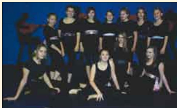
Junior Dance Club