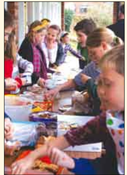
Junior School Bake Sale