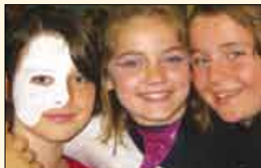
Year 7 girls prepare to dance