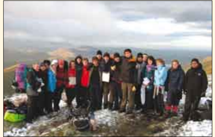
Conquering the Lake District

When signing up for Duke of Edinburgh Gold Award, we didn't know quite what we were putting ourselves in for. So on a cold and damp October morning in Half-Term, 19 sixth formers set off in order to conquer the Lake District. After a nine-hour coach journey, we arrived at the campsite to find that Cumbria was a very cold place, and set about pitching tents by torchlight. Going from Bronze in Year 10 walking round the tame hills of Wye, to trekking round the wild mountains of the Lake District was a daunting thought but we had three days of walking, with distances ranging from 15 to 25 km each day, up and around the hills and mountains near Penrith and always carrying our tents. It was a struggle for some of us and perhaps we had underestimated the amount of effort that it would take... and always with the tents! The weather was fair but bitterly cold so ice formed on the insides of the tents but such weather meant that the views across the valleys were absolutely stunning, making the long and steep ascents worthwhile... and always with the tents. The sense of achievement was terrific but we were oh so grateful for long hot baths when we returned to Kent. Next stop: Snowdonia!