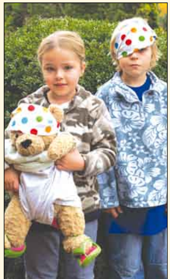
Junior School Children in Need