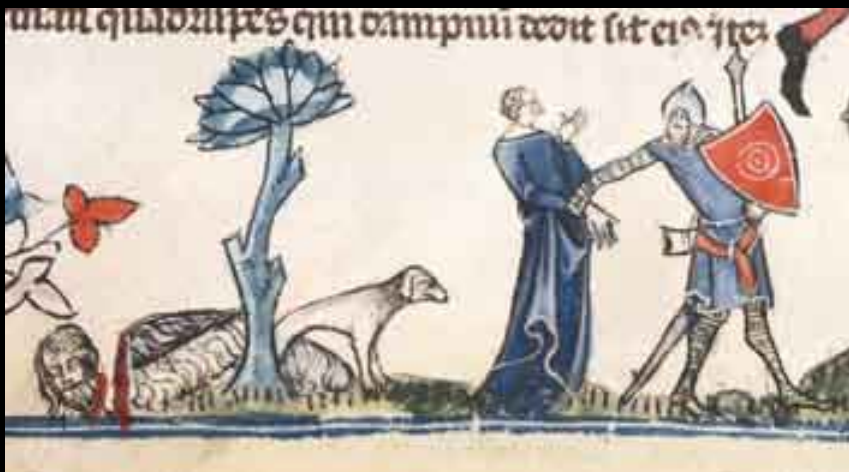
The decapitation of a 'wild man'. From the Smithfield Decretals, c. 1340