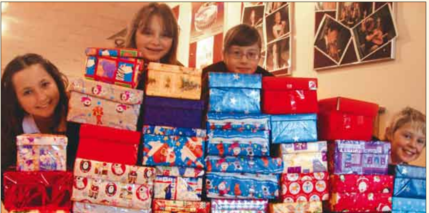
Senior School Shoeboxes