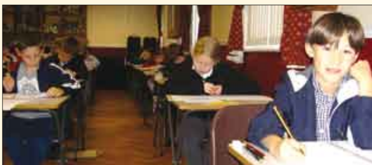
Problem Solving Competition