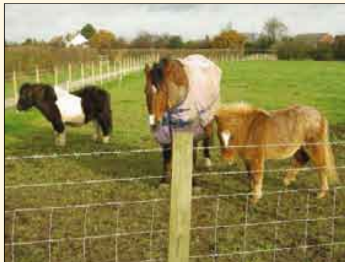
Scout, Pippin and Prince