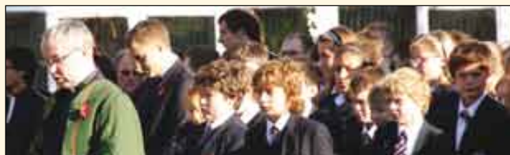
Remembrance in the Quad

As if not enough was happening within the College, the number of trips has also been terrific: a Spanish exchange; a trip to the Rhineland to discover German Christmas fairs; business trips to Sainsbury's and the Jaguar and Morgan car factories; boarders trips to Paris, to Laser Quest, to 'Go Ape' at Leeds Castle; visits to London to see shows for Drama, and exhibitions for Art; a Geography field trip to Devon; Girls' hockey to the regional finals in Essex, and so it goes on. As I write this I look forward to the last few days of term which I anticipate will get even busier as the days continue to grow shorter.