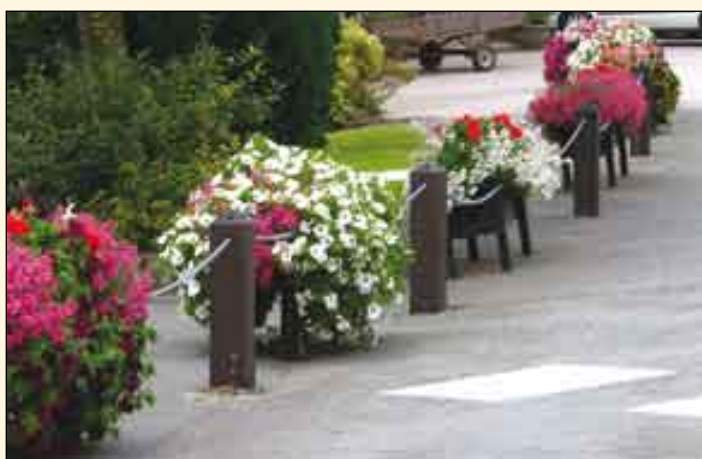
Flowers welcome you at the entrance to Vernon Holme