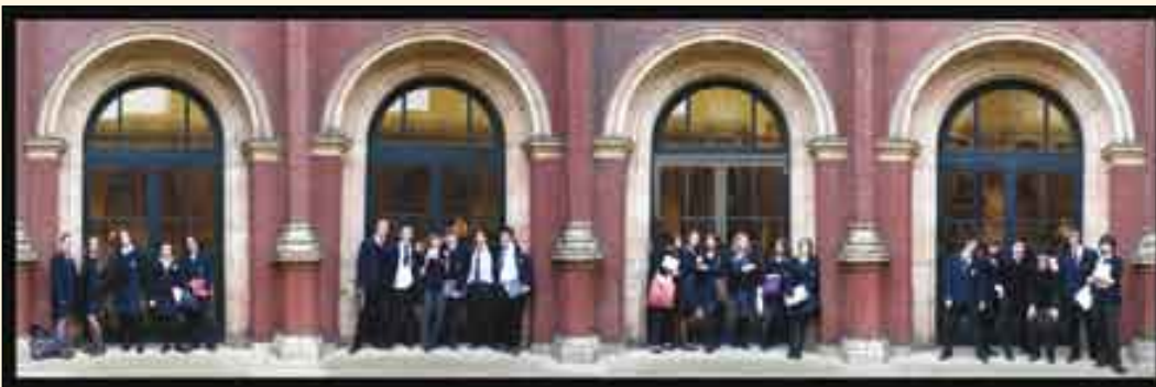
Year 11 at the V&A

Earlier in the term, the Art Department took the sixth form Art students to view exhibits in the National Gallery. You must agree that they could have been mistaken for a living work of art themselves as they waited for their guide. A similar pose was struck by the Year 11 students when they went to the V & A in November.