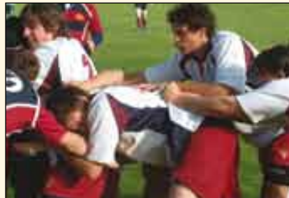
1st XV up close

'In mid November, KC 1st XV played host to Westcliff High School for Boys. Personally,