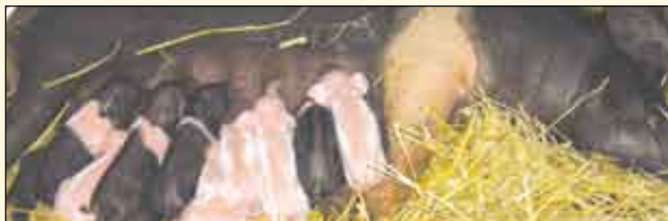
Mother and day-old babies

All of the pigs are now indoors too. Two of the sows have had their piglets and are cosy in the main barn. We have 23 piglets in total at the moment, and they are all growing very well. Our third sow is due to have her piglets on New Year's Day, but hopefully she won't cause too much work over the Christmas holidays!