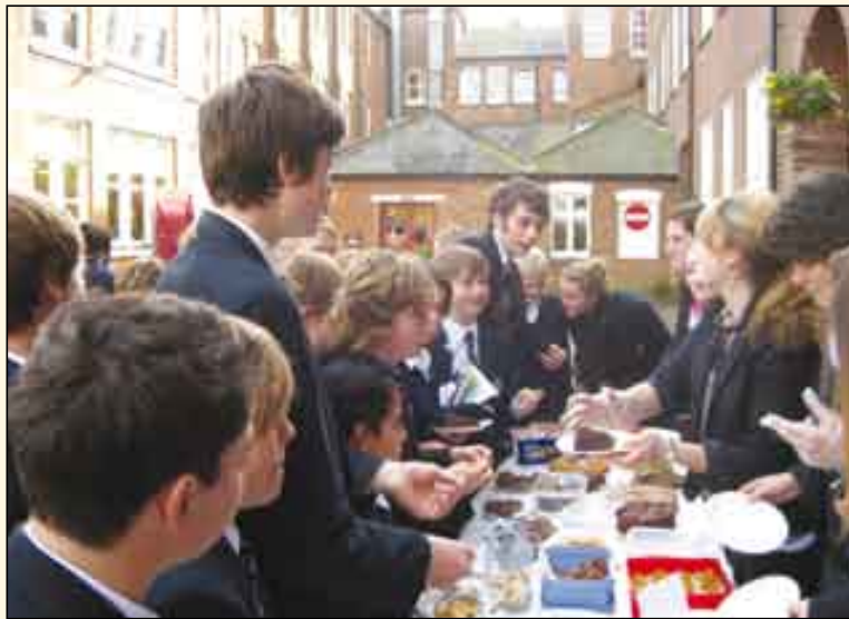
Senior School Bake Sale