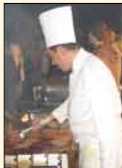
Chef cooks up a treat at the Fireworks

The Choristers gave a magnificent performance in Liverpool's Philharmonic Hall in the finals of The BBC Radio 3, Choir of the Year Children's category; they came second to a regional choir from Kettering called 'Masquerade' and did themselves and Kent College proud.